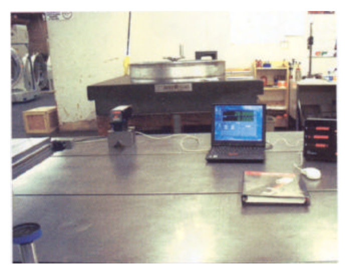
Data collection during calibration of Tapemations's large Brown and Sharpe MDL 3000 Validator CUM. The MCV 4000 laser head is shown at the left-rear corner of the CMM tabletop. Laptop stores data.

An Optodyne MCV 4000 laser calibration system was purchased with a dual beam laser head, dual channel processor and squareness optics for running linear, angular (pitch, yaw, straightness, flatness) and squareness