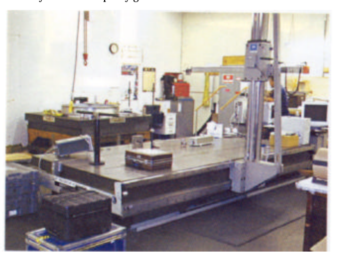
View of the MCV 4000 checking Z-axis motion on the Brown & Sharpe CMM. A mirror attachment is used for the purpose.

"An outside service for just calibrating our CMM was charging us $6,500 year, two times a year. The service technician couldn't calibrate some of our other machines. And they had a very difficult time doing our 5-axis and rotary tables. We used to spend half the cost of the Optodyne system every year calibrating all our machines. A two-year ROI is a pretty good investment."