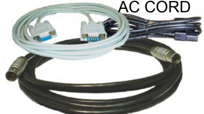
LD-21L (Quantity of 2)