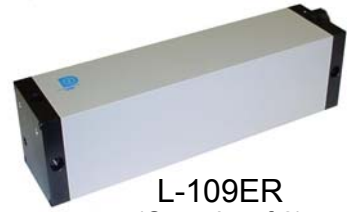
L-109ER (Quantity of 2)