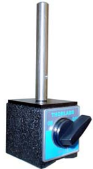
LD-03P (Quantity of 2)