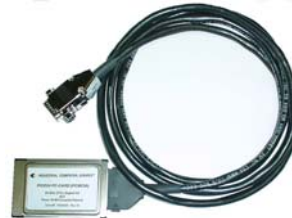
IPC5-1000 (Quantity of 2)