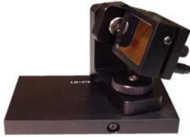
LD-37S (Quantity of 2)