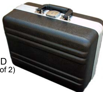
LD-20D (Quantity of 2)