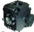
R-102 (Quantity of 2)