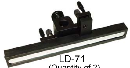
LD-71 (Quantity of 2)