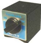
LD-03 (Quantity of 2)