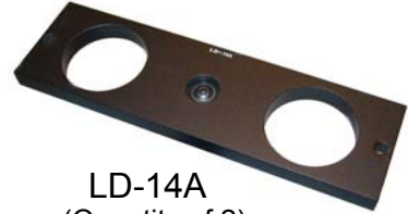
LD-14A (Quantity of 2)