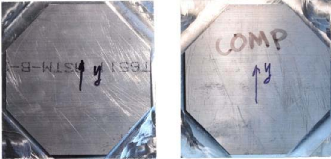
Fig. 2, the part on the left is not compensated and on the right is compensated.

Based on these G-codes, 2 parts were machined with 0.5” diameter end-mill as shown below.